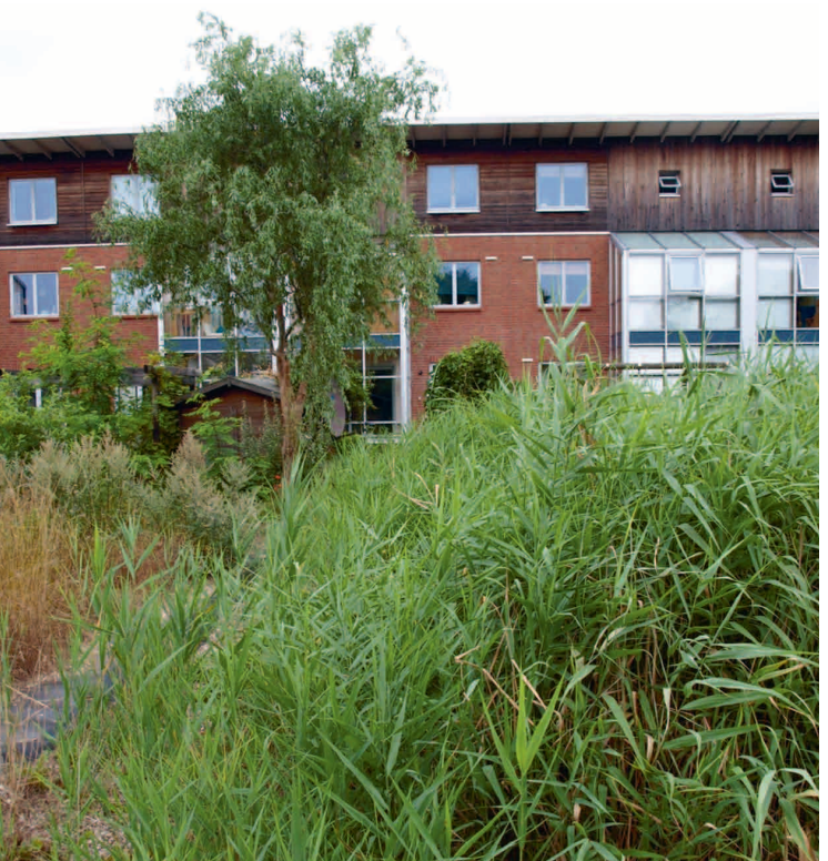
Image left: Constructed wetland for greywater treatment at the Lübeck-Flintenbreite settlement

Content of the different domestic wastewater streams (urine, faeces, greywater) in percentages and absolute values (BOD is biological oxygen demand).