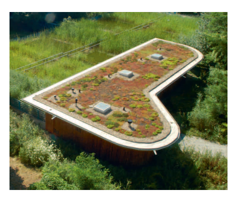
Image left: View of a soil filter for rainwater evaporation and a visitor centre (with green roof), housing a multistage greywater recycling facility (close to Potsdamer Platz, Berlin)